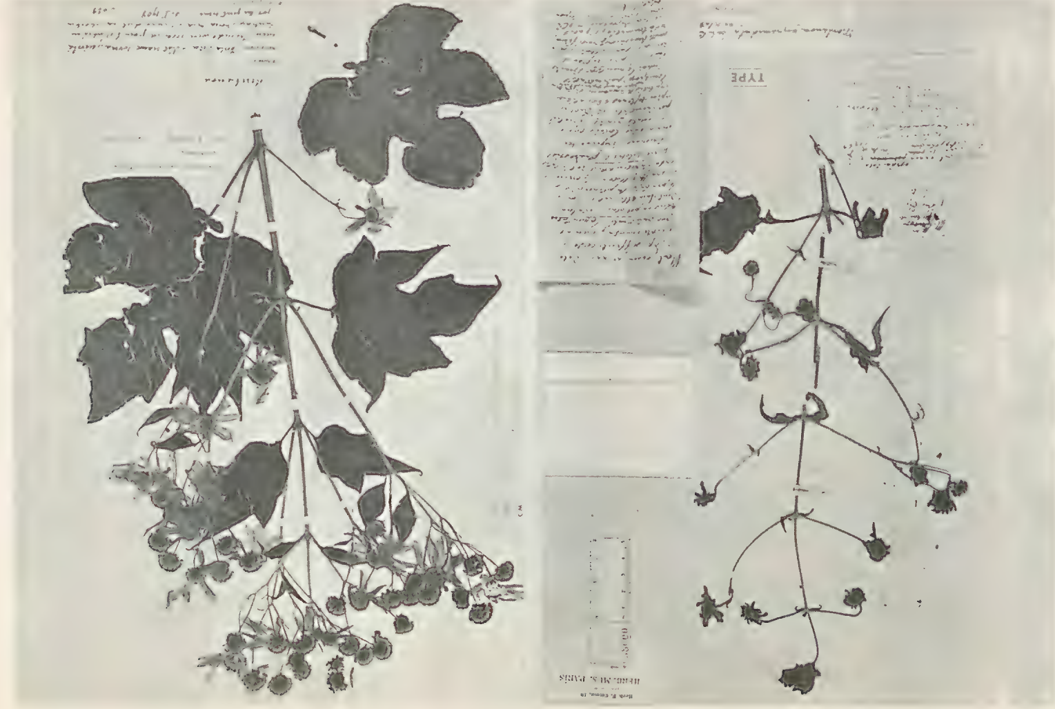
Fig. 4. Lectotype of the name Montanota pyramidata Sch. Bip. ex C. Koch; Herb. P. Fig. 5. Lectotype of the name Montanota wercklei A. Berger; Herb. K.